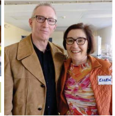
Parish "Pot luck" Supper Saturday May 6, 2023 organized by the Activities Committee.