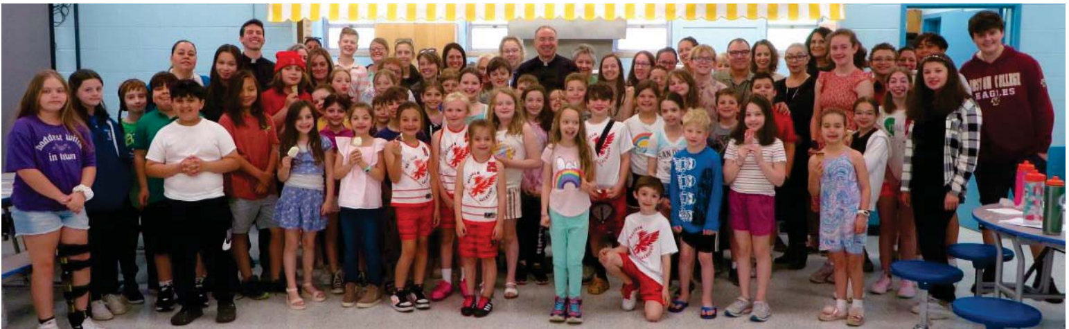
Religious Education Year-end Ice Cream party May 7, 2023 Thank you to all the dedicated teachers and volunteers.